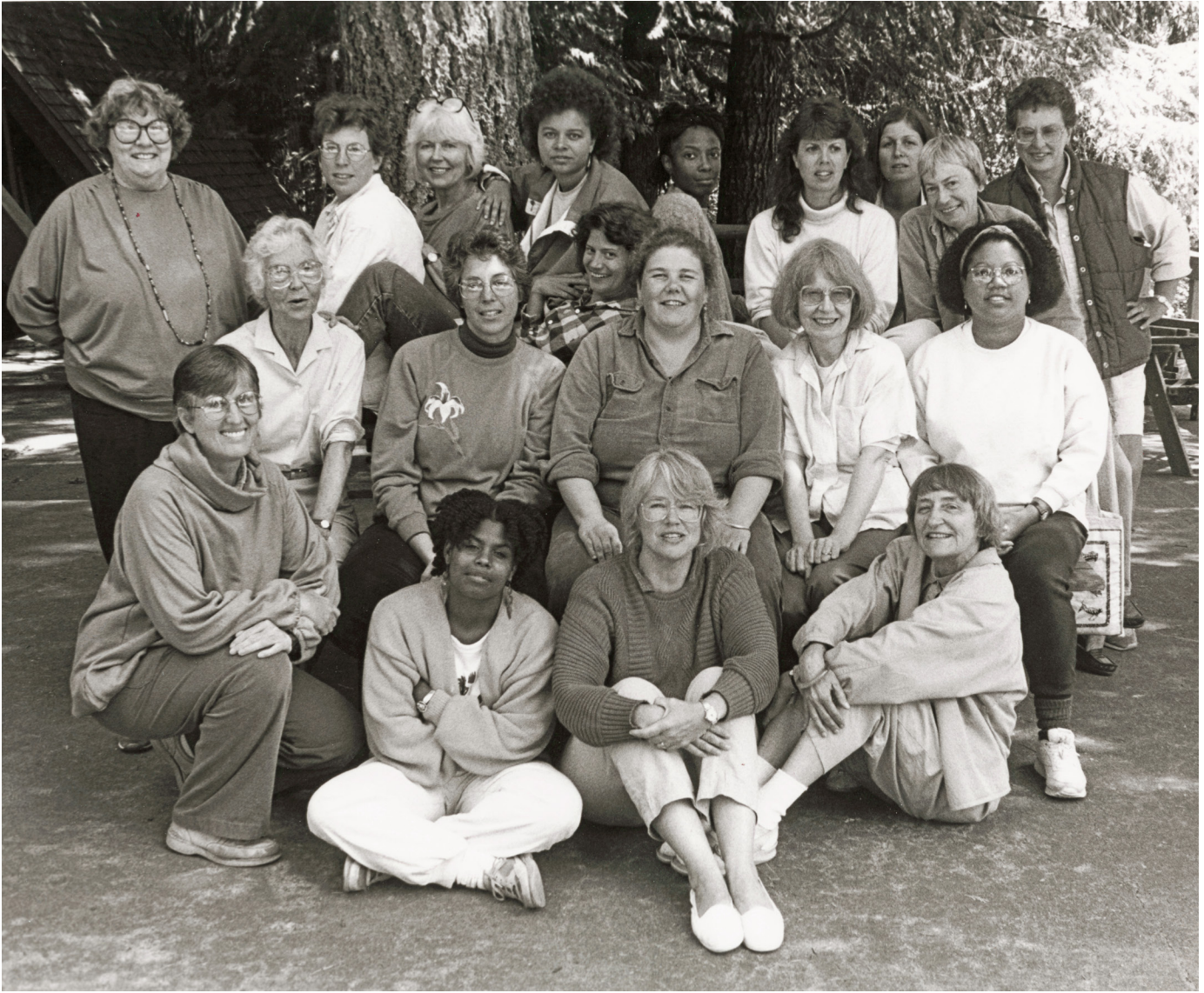
Ursula K. Le Guin's Class, 1989